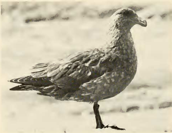
Figure 5. Great Skua ( Catharacta skua antarctica ) nesting at Punta Tombo, Argentina.